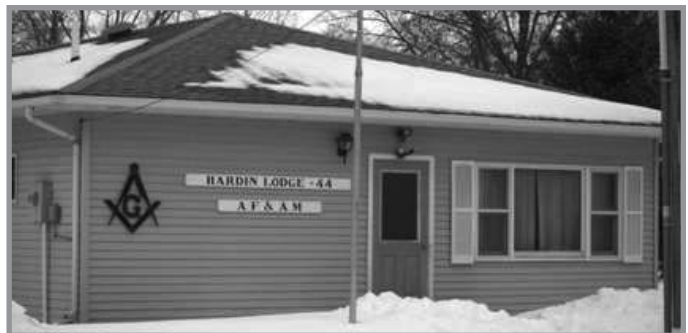
Mason's Hardin Lodge